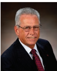
John Monaco Mayor

Poteet H.S. 3300 Poteet Breakfast: 6/10 - 7/10, 7:30 - 9:15 a.m., Monday - Thursday Lunch: 6/10 - 7/10, 11 a.m. - 1 p.m., Monday - Thursday