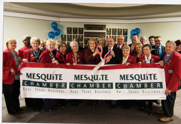
On November 6, Eastfield Community College (ECC) announced a partnership with Columbia College to begin offering four-year degrees to students at the ECC campus located in Mesquite.