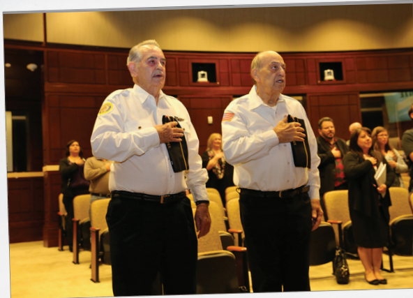
At the November 3 City Council meeting, members of the American Legion Post 504, located in Mesquite, led the Pledge of Allegiance.